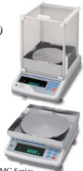
MC Series with auto-centering pans

Please also visit our video library at www.aandd.jp to see how it operates!