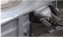
Water Proof RS-232C Cable (optional)