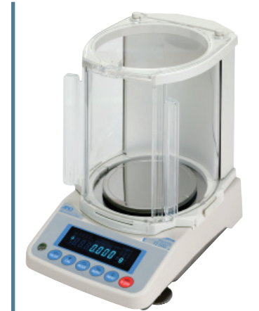
FZ-300i with optional Breeze Break FXi-11