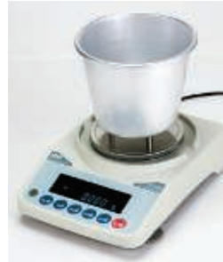
FX-3000i with optional Animal weighing pan FXi-12