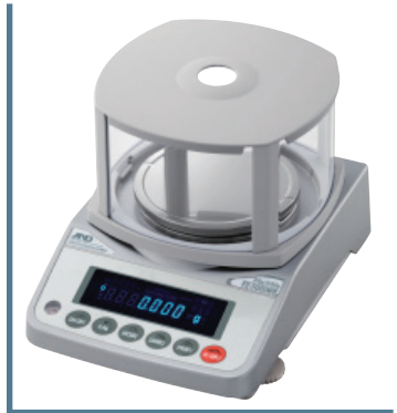
FZ-300iWP with small Breeze Break (standard on 1mg models)

For the user that wants it all, the FZ-iWP adds internal calibration to complement the IP-65 rated dustproof and waterproof features. Here is a balance that be used virtually anywhere.