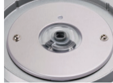
Sealed Pan Support