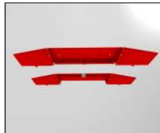
Underneath the AX200 Portable Axle Scale