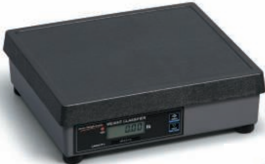
Model 7815 shown with six-digit LCD internal display