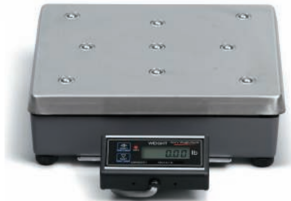
Model 7815R shown with standard 7" remote only