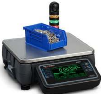
175 lb (80 kg) and 70 lb (35kg) models 12 in x 14 in (305 mm x 355 mm) platter

A robust die-cast clamshell enclosure provides protection for the Quartzell transducer. 1100% overload protection and a spring breakaway mechanism protect the cell from shock and dropped loads, ensuring accuracy and repeatability in even the most extreme conditions.