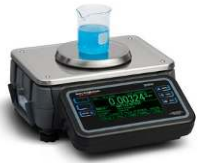
10 lb (5 kg) and 2 lb (1 kg) Models 6 in (150 mm) round platter