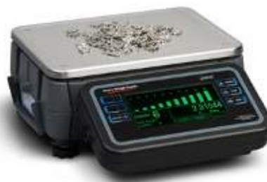
70 lb (35 kg) model 9 in x 12 in (230 mm x 305 mm) platter