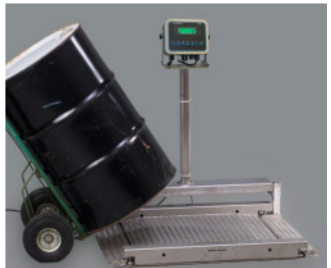
Stainless steel with optional stationary indicator mounting kit and indicator column

The Drum Weigher is a multi-purpose low profile scale allowing wheeled bins and drums to be easily pushed on and off while being strong enough to support pallets loaded from the side. It was designed to operate under some of the most intense and demanding weighing requirements - remaining strong and rugged while providing fast, accurate readings at all times. The Drum Weigher's durability is reinforced by six steel channels which are 3 \frac{1}{4} " wide supporting the 30" x 30" weighing surface.