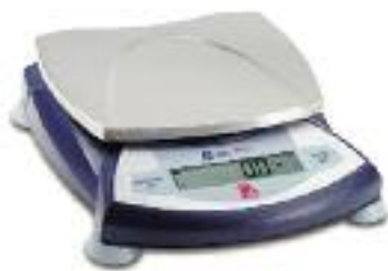
Scout Pro with Square Platform (6.5 x 5.5 in / 16.5 x 14.2 cm)

600g x 0.1g 2000g x 0.1g 4000g x 0.1g 6000g x 0.1g 6000g x 1g