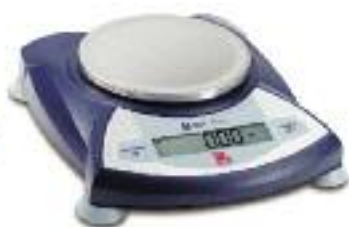
Scout Pro with Round Platform (4.7 in / 12 cm diameter)

600g x 0.1g 2000g x 0.1g 4000g x 0.1g 6000g x 0.1g 6000g x 1g